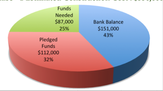
Phase - 1 Estimated Construction Cost: $350,000