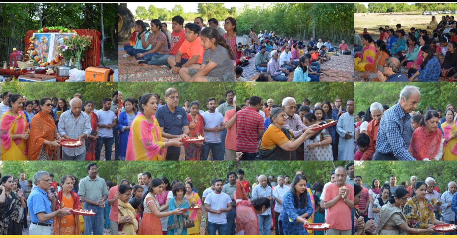
Hanuman Jayanti Celebrations in Lafayette - April 9th, 2017