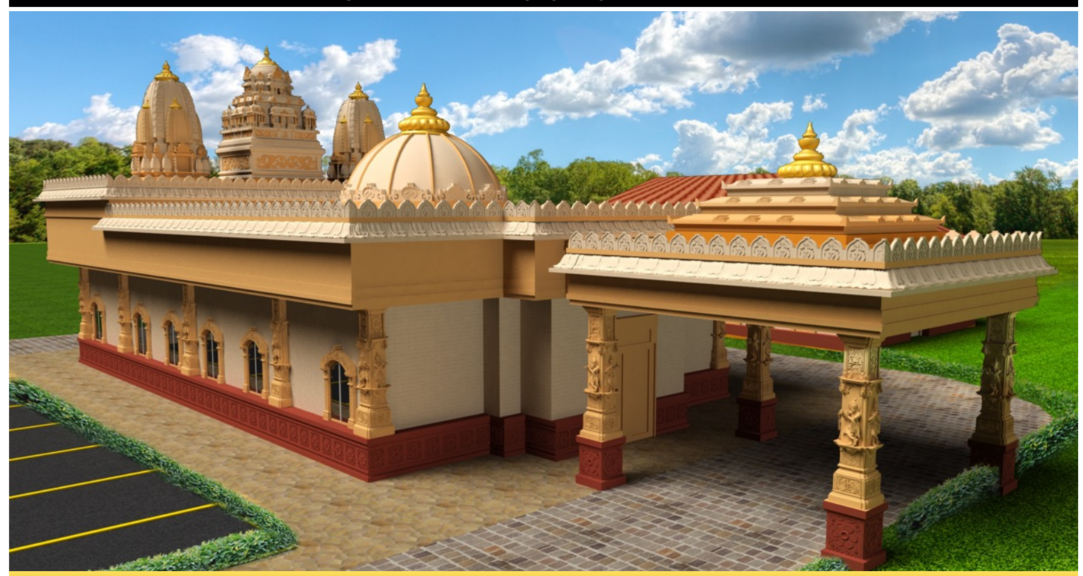
SHSK Temple, Lafayette, Louisiana - Targeting April 2018 for completion and Inauguration