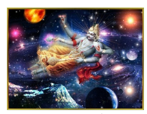
completes. Now we move on to the definition of time.

So now imagine this entire Brahmandam is in a place where above this all the other lokhas such as vayu, agni, surya, chandra, nakshatra lokhas, and saptarishi mandalam all together in one place. Again imagine this entire set is inside an eye, an eye of a dolphin. In sanskrit this dolphin is called Shimshumaram. Now flip this dolphin upside down where in its eye this entire set of 14 lokhas along with surya, chandra, saptarishi mandalas are placed. Beside this Shimshumara chakra there is Dhruva mandal. This huge collection of lokhas and mandalas together in this format is residing as a spec of dust in Maha Vishnu's belly button. Thus the definition of space in which we resides