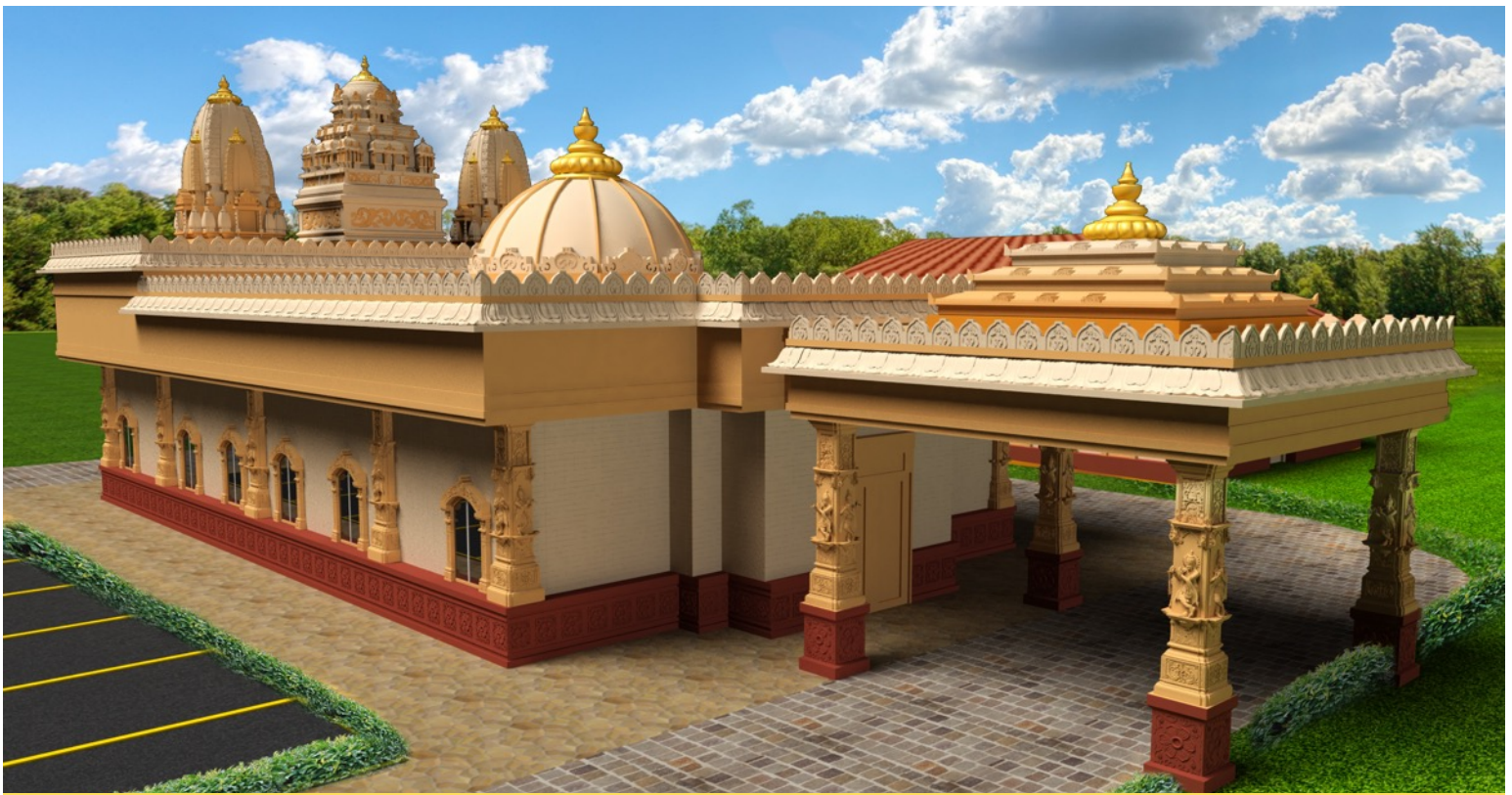
SHSK Temple, Lafayette, Louisiana - Targeting April 2018 for completion and Inauguration